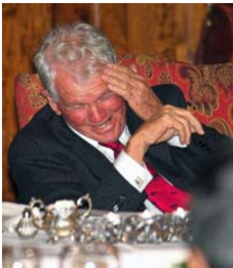
Golf legend Jackie Burke laughs at guests' stories about him during the NAM Endowment Funds "Grand Slam" dinner and roast.