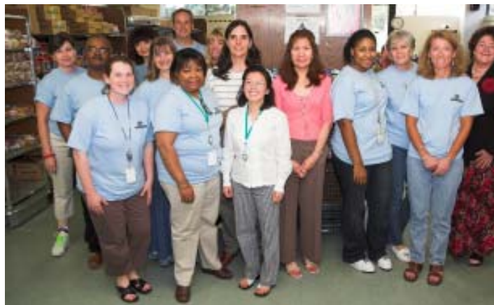
Newfield Exploration employees recently volunteered in NAM's Food Pantry stocking shelves. Newfield employees also have contributed to NAM through grants from the company's Newfield Foundation.