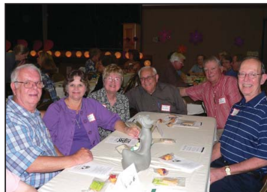
Volunteers of NAM's Meals on Wheels Program gather at the Annual Volunteer Appreciation Luncheon.