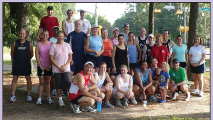
The 2008 TEAM NAM members gather for a photo after enjoying a post-run Saturday oatmeal breakfast at Meyer Park.

More Information: www.MarathonTeamNAM.org E-mail: MarathonTeamNAM@gmail.com